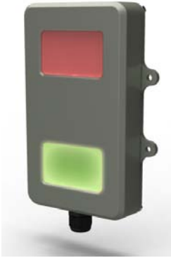
Dimension ( mm )